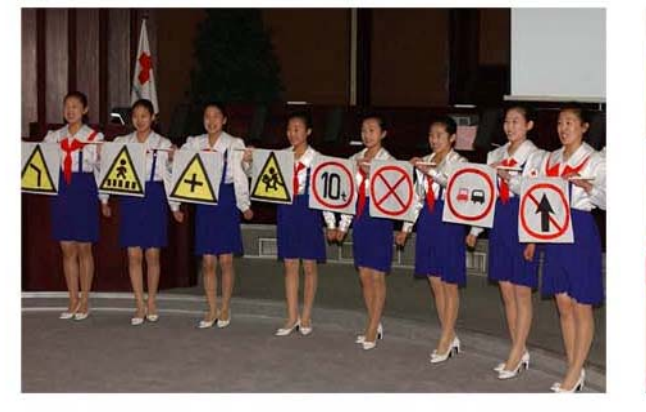
Efforts are made to aid victims of calamities and provide sanitary conditions.