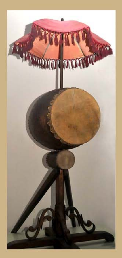
A standing drum (4<sup>th-5<sup>th</sup></sup> century).

IN THEIR 5 000-YEAR-LONG history notable with a brilliant culture, the Korean people have made and used musical instruments of their own, peculiar in tone and shape, which suited to their sentiments and emotions.