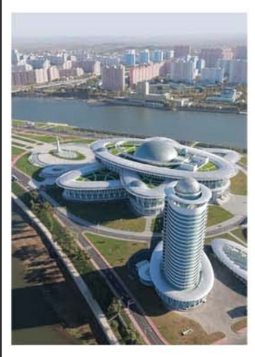
Back Cover: The Sci-Tech Complex