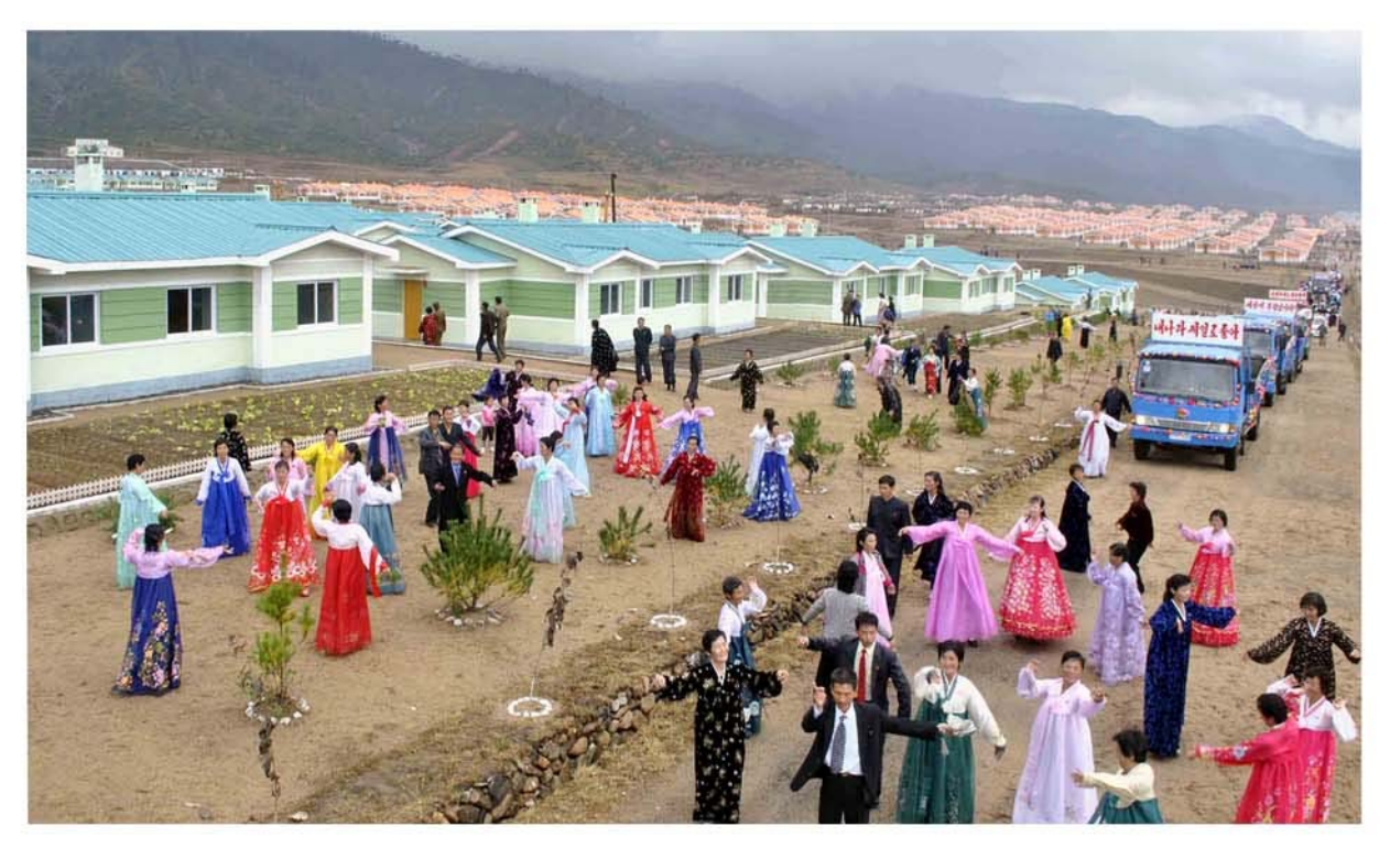
Flood victims dance merrily moving into new houses.

lifetime instructions of the great leaders, the Korean people took a big stride in developing the metallurgical industry in their own way, built model plants and standard factories befitting the era of the knowledgebased economy in all parts of the country, and put the production processes on a modern and IT footing.