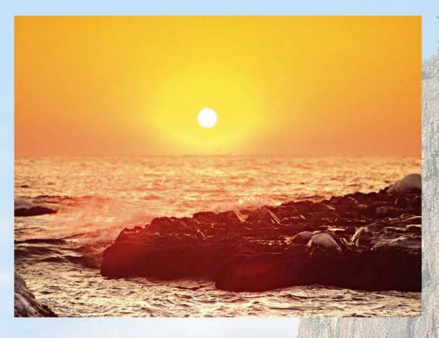
Sea Chilbo in the morning.

called Tal Gate which looks like the moon in its shape. Tal Gate is an erosion arch of lava with a high cliff at the back and scores of metres deep sea in front. Its one end is stuck to a huge rock hill and the other in the sea. The gate is famous for many traditions. It was widely told about by fishermen who passed through it, and it served as a refuge in a stormy weather. It was said that Tal Gate served as a resting place for the moon to get a good view of the picturesque Sea Chilbo in the daytime. Sea Chilbo has many other scenic spots like Jolsung (superb beauty) Peak, Sonnam (fairy man) Rock, Sonnyo (fairy woman) Rock and Ryangju (couple) Rock.